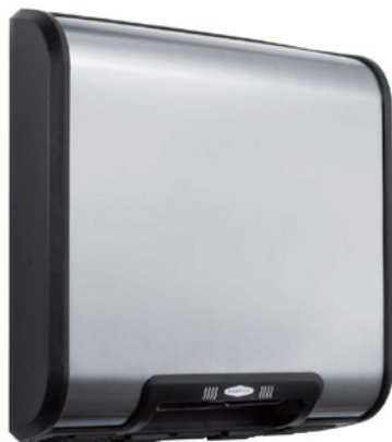
B-7128 QuietDry™ Series, TrimDry™ Surface-Mounted Hand Dryer