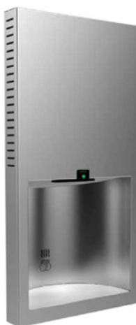
Bobrick B-3725 Recessed Hand Dryer

Located in the heart of London's Fitzrovia district, 42 Berners Street is a contemporary development featuring 20,000 square feet of office space and 5,000 square feet of retail space. The beautiful office building, designed by award-winning architects Buckley Gray Yeoman, boasts seven floors of cutting-edge meeting rooms, boardrooms and breakout spaces, and is surrounded by world-class dining, entertainment and shopping venues.